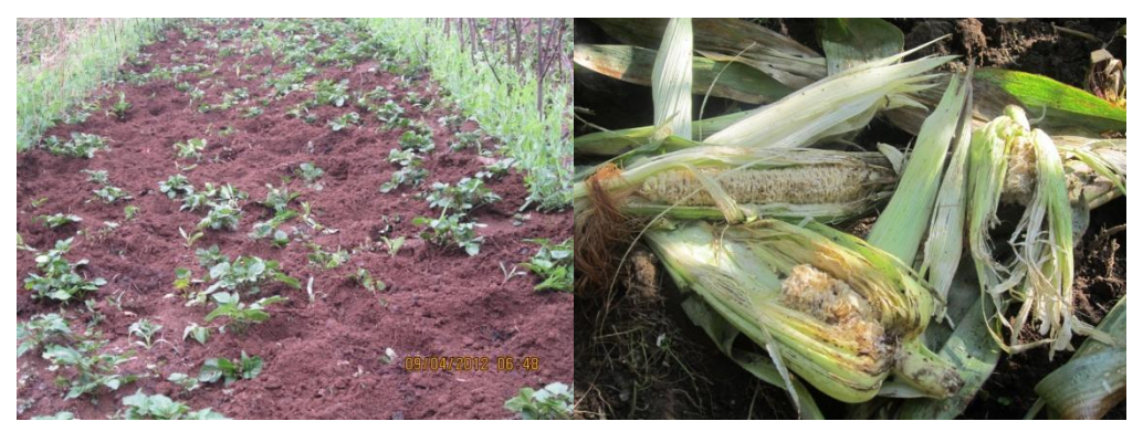
Sparse potatoes after three wildboar raid

Crop damage came out to be the main source of conflict across the different studies, rather than direct encounter between man and animals and resultant injury. The data generated during the project period of April 2011 to May 2012 shows that the major extent of damage of crops are from the months; March to September.