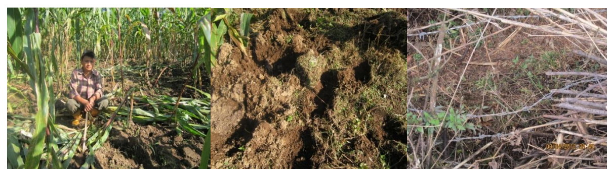
Maize damaged by boars

one night. Himalayan black bear used to be a major problem during maize harvest before wild boars started coming.' Mr. Pasang Sherpa, 64 years old, Samanden Forest Village.